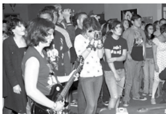
THE DEBUTANTES OF ORANGE COUNTY (United States, 2006) Dir.: Rhianna Paz Bergado Explores the crossroads of music, culture, and gender hidden behind the Orange Curtain.